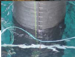
SeaShield Series 2000FD System designed to withstand the most aggressive environments.