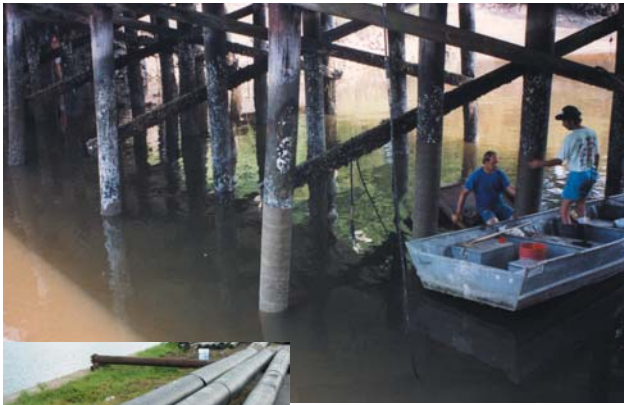
SeaShield Series 90 consists of Denso Marine Piling Tape preventing marine borer destruction and an outcover for mechanical protection of tape.