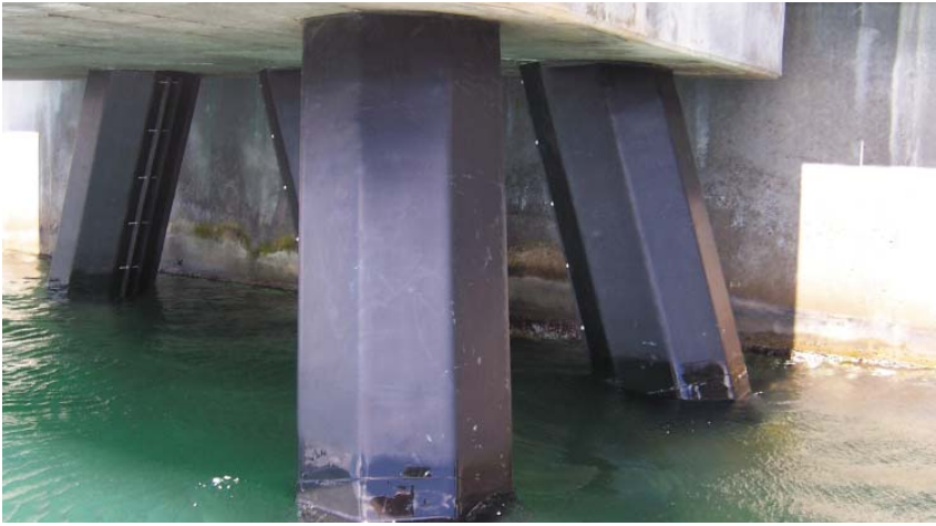
SeaShield Series 2000HD System was used to protect octagonal concrete bridge piles.