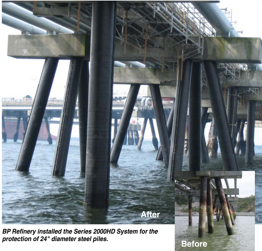
BP Refinery installed the Series 2000HD System for the protection of 24" diameter steel piles.