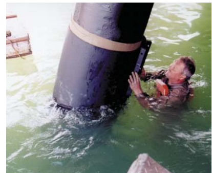
The components of the Series 2000HD System can be applied under water with minimal surface preparation.