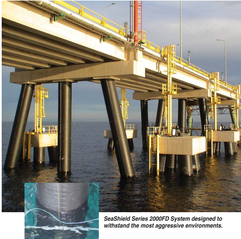
SeaShield Series 2000FD System designed to withstand the most aggressive environments.