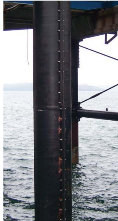
The SeaShield Series 2000FD System features a controlled application tensioning system.