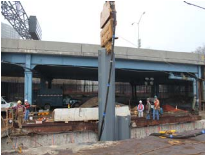
Rigspray coated steel sheet piles being driven into the mudline for a transportation project in Manhattan, NY.