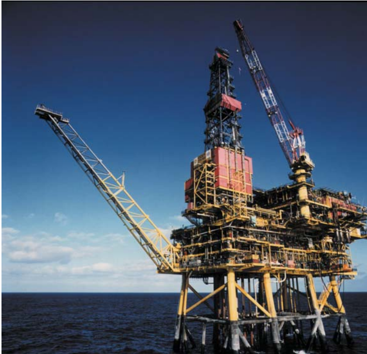
Denso Rigspray can be used on offshore rigs and structures to protect areas subjected to high corrosion.