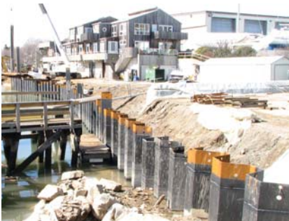
Side view showing initial phase of the Boston Marina using Denso Rigspray steel sheet piles.