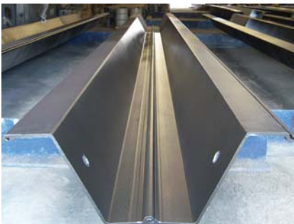
New sheet pile just after Denso Rigspray was applied (55" wide x 45' long weighing over 6,000 lbs).