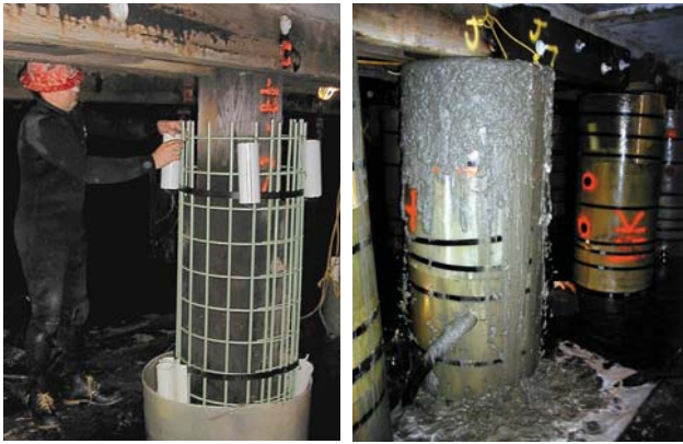
Structurally repaired timber piles with rebar, concrete and translucent SeaShield Fiber-Form fiberglass jackets. The jackets can be manufactured to be translucent or gel coated to a color.