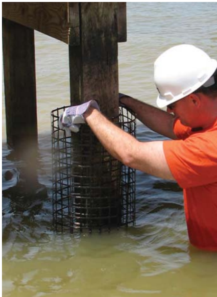
The lightweight and non-corrosive C-GRID® 450 is installed around the pile.