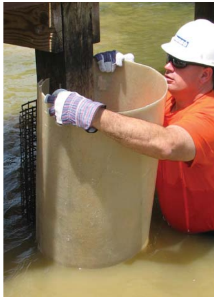
The SeaShield Fiber-Form jacket is then snapped in place around the C-GRID® 450.