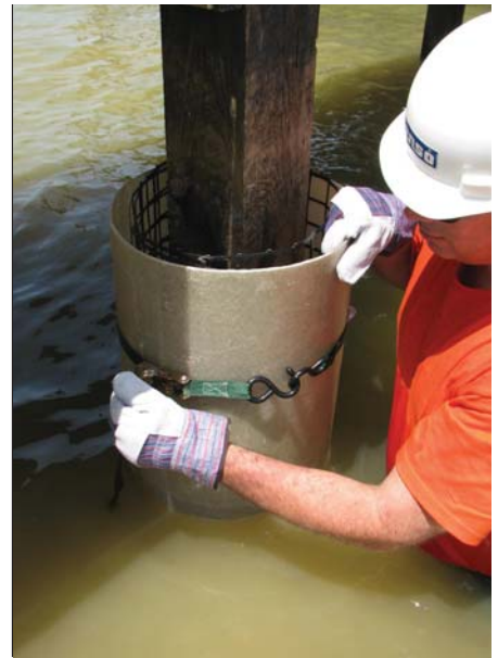
Grout can be pumped as soon as the SeaShield Fiber-Form jacket is secured in place.