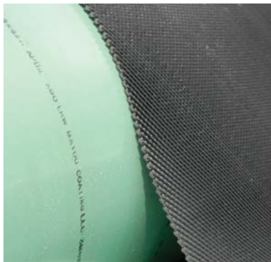
Denso Rockshield HD protects the pipes anti-corrosion coating.