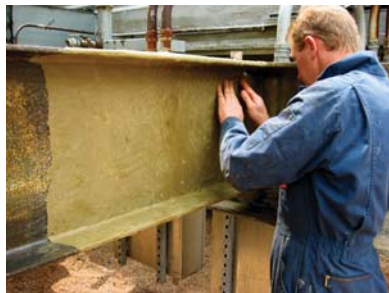
Petrolatum Tape system (Denso Hi-Tack Tape) applied to structural steel.