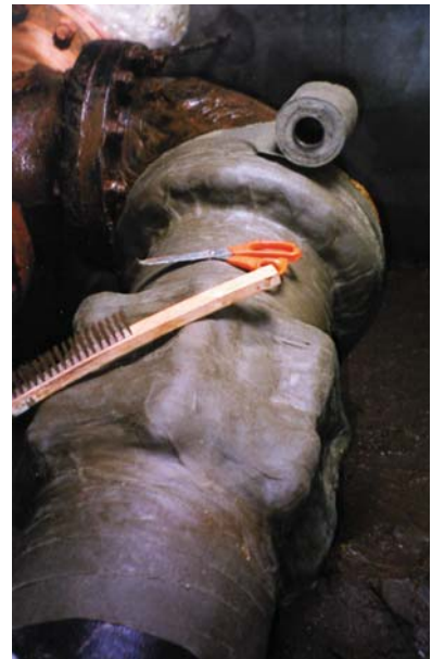
Complete corrosion protection of pipe, flange and coupling.