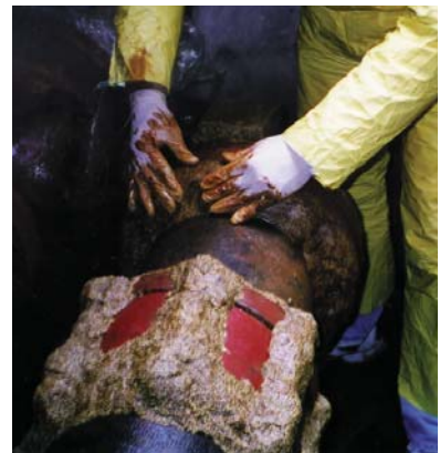
Application of Petrolatum Tape system.