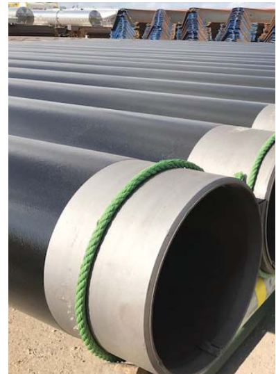
No primer is required when applying Protal 600 CTE.