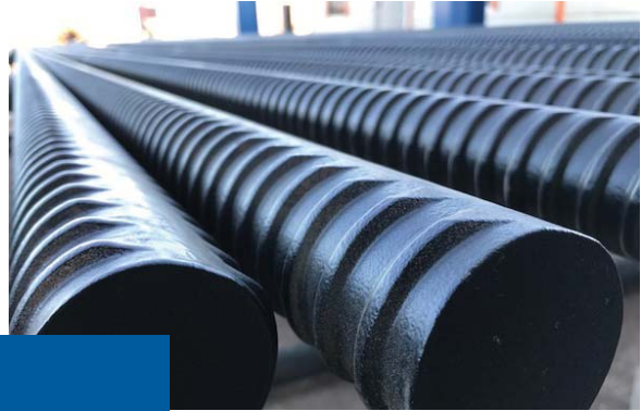
Tie rods coated with Protal 600 CTE Low VOC. Only 0.4 lbs/gal (50 g/l) VOC.