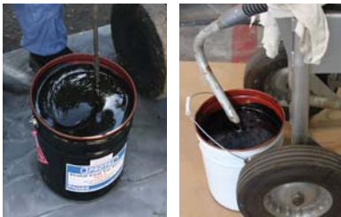
Protal 600 CTE is a two-part high build coal tar epoxy that is applied with a single leg airless unit.