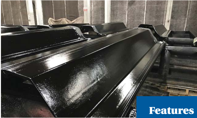
Protal 600 CTE provides long-term corrosion protection to steel sheet piles.