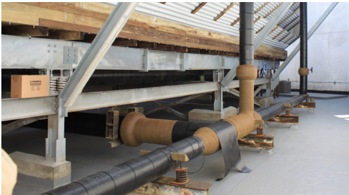
Overview of the complete Denso corrosion protection system for cooling towers for pipes, valves and fittings.