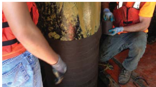
Installation of Denso S105 Paste and Densyl Tape to a 24" steel pile.