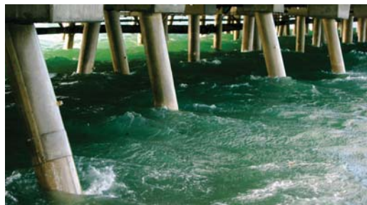
Completed SeaShield 500 System.