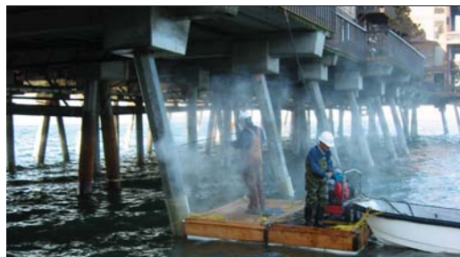
Preparing surface with high-pressure water blasting.