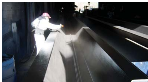
Spraying Denso Rigspray to sheet pile.