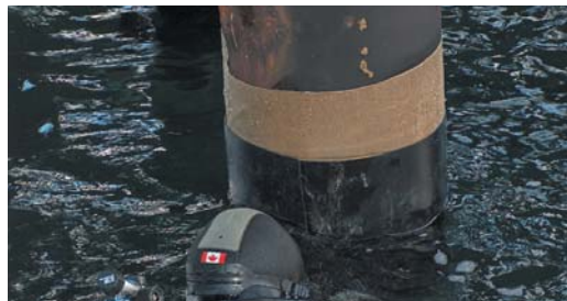
Diver securing the SeaShield 100 Series Jacket into place.