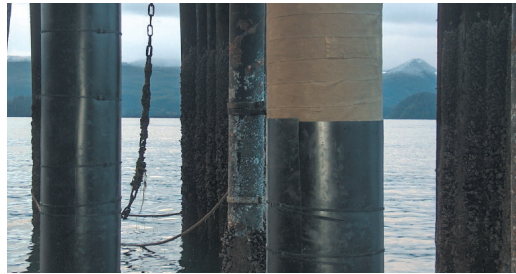
Center of picture shows Denso Marine Piling Tape protected pile with lower jacket in position