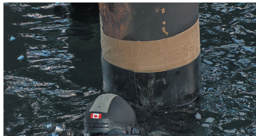
Diver securing the SeaShield™ 100 Series Jacket into place.