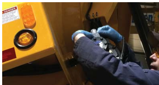
Denso ColorTape is easily applied by hand and requires no primer.