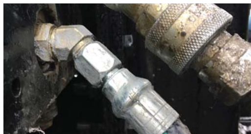
Denso ColorTape removed after 1 year (left fitting) vs one fitting (right fitting) that was not wrapped.