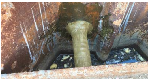
A tie rod fully protected with the Denso Petrolatum Tape System to prevent rusting.