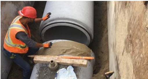
Denso LT Tape will remain flexible and continue to seal, even if the concrete cracks.