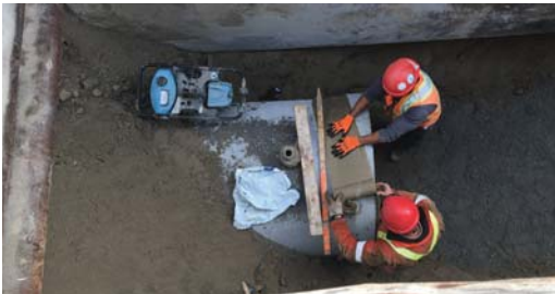
A section of the 1 metre diameter wastewater concrete piping installation being prepped for water infiltration protection with Denso LT Tape.